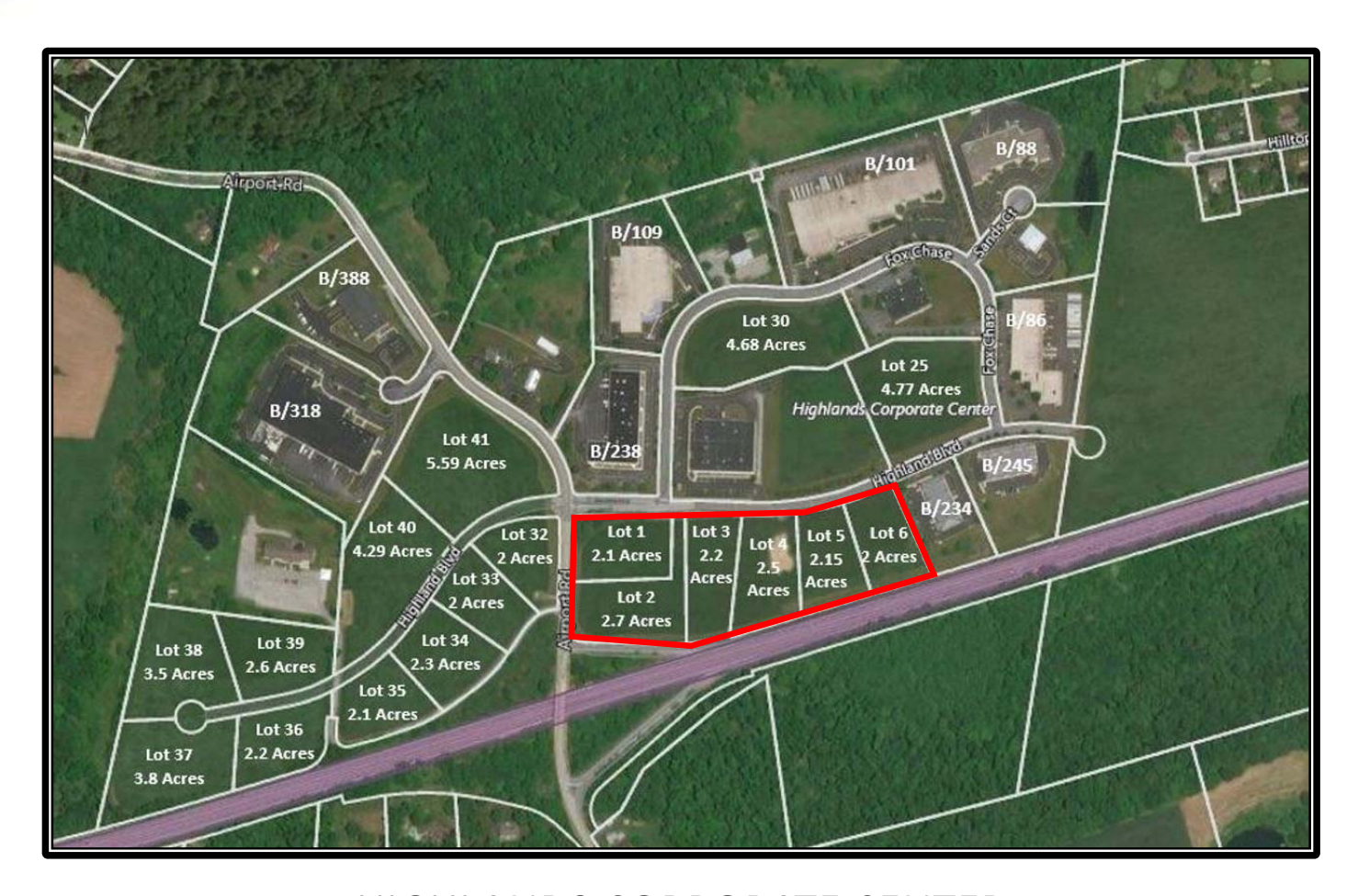
HIGHLANDS CORPORATE CENTER HIGHLANDS BOULEVARD, LOTS 1-6COATESVILLE, PA 19320